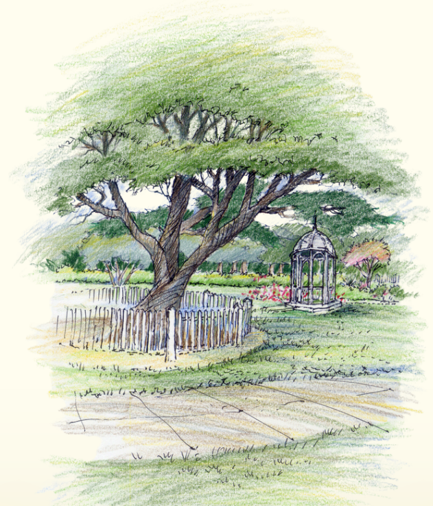
Art by Chuck Crotser