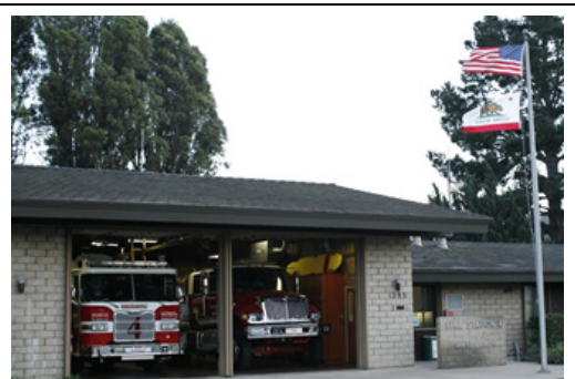
Fire Station Four is located at 1395 Madonna Road and is the closest station to the Project site.

Fire Station Four: Constructed in 1978, this station is the western-most station and is located in the area of Laguna Lake at 1395 Madonna Road and is the closest station to the Project site. The station is staffed with a three-person paramedic engine company (Type I pumper/fire engine). Additional equipment housed at Fire Station 4 includes an unstaffed Type III fire apparatus.