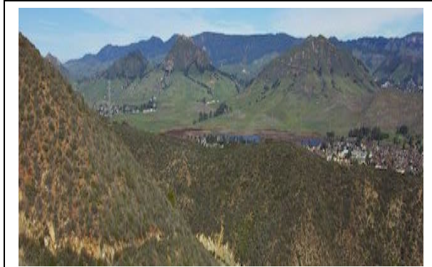
Islay Hill Park is located 3.1 miles northeast of the Project site and provides passive recreation opportunities (i.e., trails).

The San Luis Obispo Parks and Recreation Department is responsible for providing the community with park facilities, recreational programs, planning new park facilities, and managing City open space that is accessible to the public. There are 21 parks and sports facilities located throughout the City in addition to 10 designated Natural Reserves and open spaces (City of San Luis Obispo 2015a). There are three parks located in the general Project vicinity, including Islay Hill Park (3.1 miles northeast), Las Praderas Park (1.5 miles northwest), and French Park (2.6 miles northeast) (City of San Luis Obispo 2012). In addition, the Johnson Ranch and Irish Hills Natural Reserve open space areas and associated hiking trails lie approximately 1.5 miles west of the Project site across U.S. Highway 101.