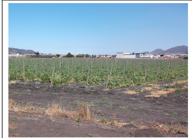
The Project site supports active agricultural production of row crops and has been in agricultural use for decades.

The following section evaluates the potential impacts of the Avila Ranch Development Project (Project) on site-specific and regional agricultural resources, including prime farmland located within the City of San Luis Obispo (City). It also evaluates the Project's consistency with the Conservation and Open Space (COS) Element and Land Use Element goals, programs, and policies in the City's General Plan and related planning policy documents, as well as relevant