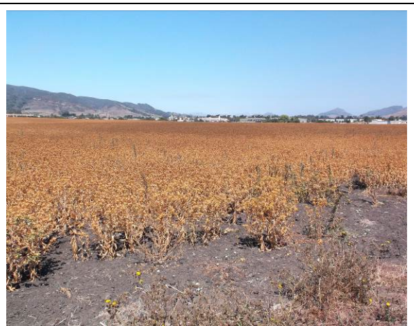
The Project site has historically been cultivated with dryland rotational crops.

Lands within the City currently used for agricultural purposes are located approximately 0.5 to 1.0 mile north and northwest of the Project site. All these lands are designated for urban development and are subject to eventual conversion. The Project site is adjacent to County-designated agricultural lands to the east, south, and southwest. These lands are designated by the County for agricultural use and include prime farmland, farmland of statewide importance, and farmland of