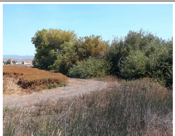
The Project site is within a Moderate Wildland Fire Hazard Zone and contains open grasslands and riparian vegetation that present moderate wildfire hazards.

In central California, the fire season usually extends for approximately five to six months, from late spring to fall, or roughly May through October. The duration of the fire season is influenced by a combination of climatic, vegetative, and physiographic conditions; rainfall totals, distribution and/or drought conditions may affect the duration of this period. Structural losses or damage from wildfires can be caused directly due to wildland fires, but also often result from