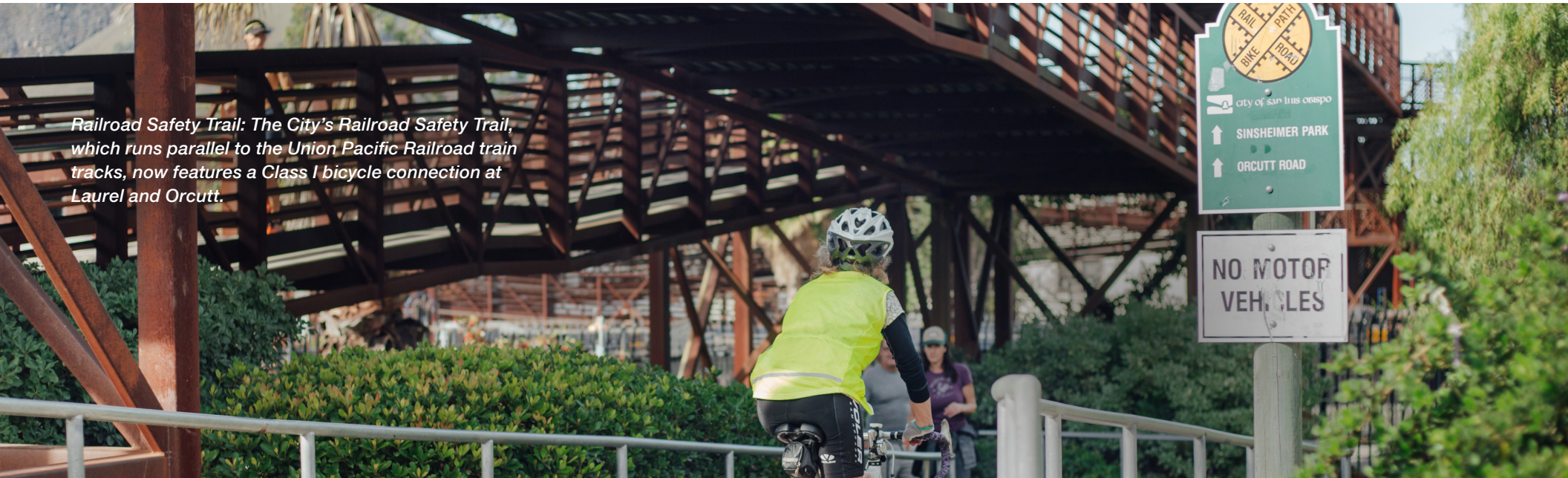
Railroad Safety Trail: The City's Railroad Safety Trail, which runs parallel to the Union Pacific Railroad train tracks, now features a Class I bicycle connection at Laurel and Orcutt.

The voter-approved ballot language provides guidance to use local sales tax revenue to protect and maintain essential services and facilities, and identifies examples of services and projects that achieve this objective. These community spending priorities help guide the Citizens' Revenue Enhancement Oversight Commission (REOC) when making recommendations to the Council about the Local Revenue Measure uses. The Council uses the REOC's input, and additional public feedback, to prioritize the use of Local Revenue Measure funding as part of the City's two-year financial planning process.