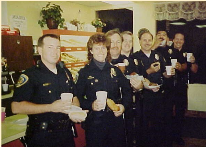
Cops & Donuts!