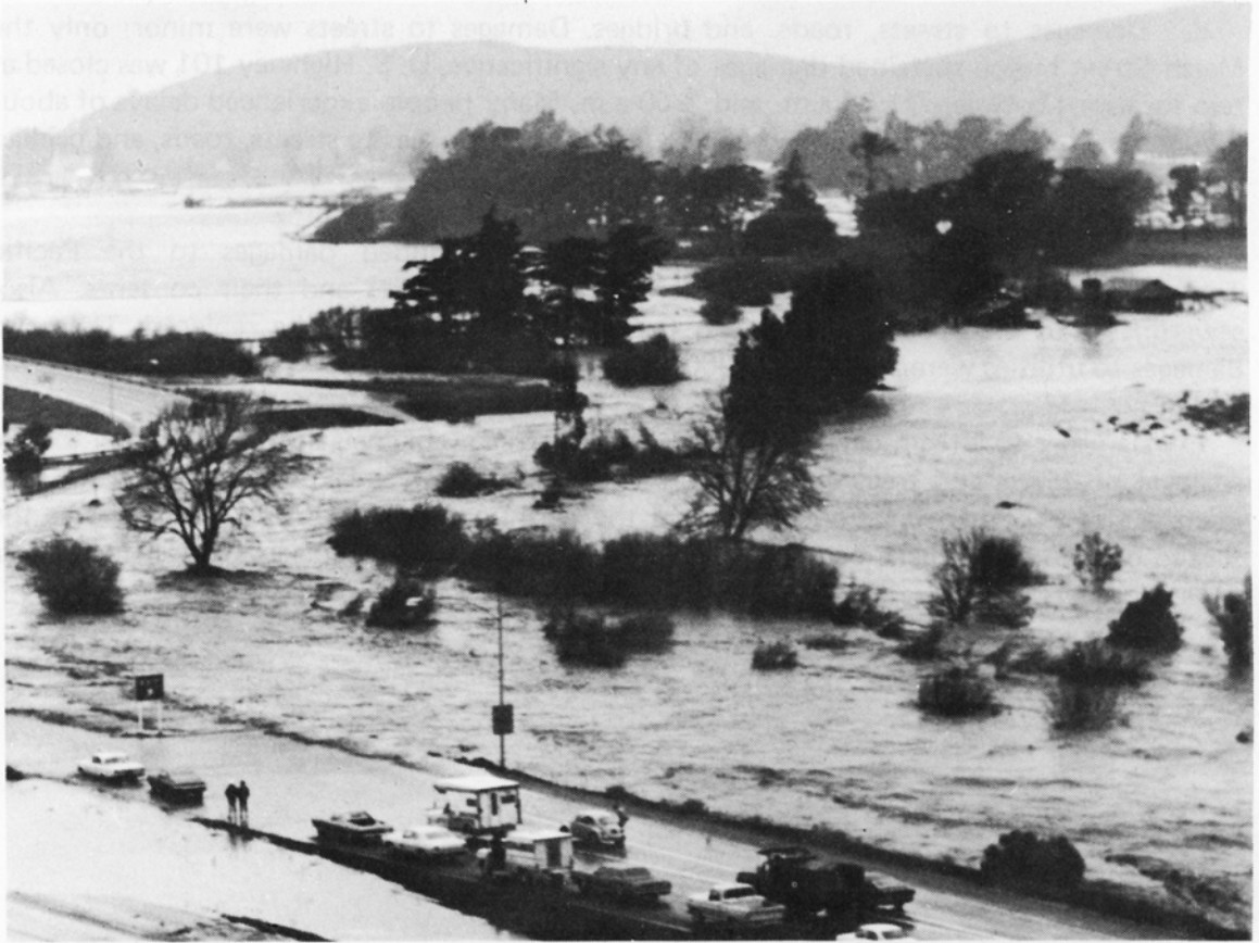
U.S. Highway 101 becomes impassable near the confluence of San Luis Obispo Creek and Prefumo Creek.