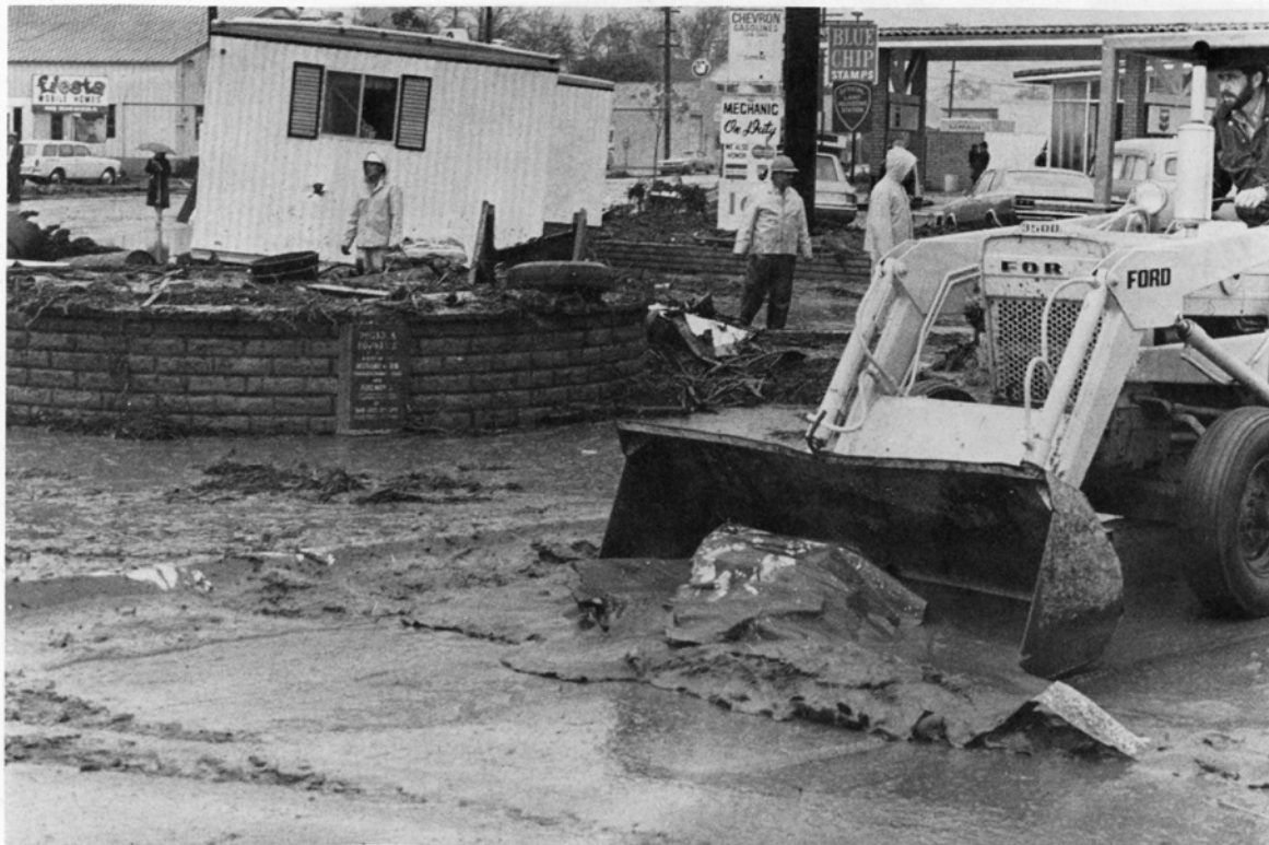
Cleanup operations by the city and volunteers commenced immediately after the storm.