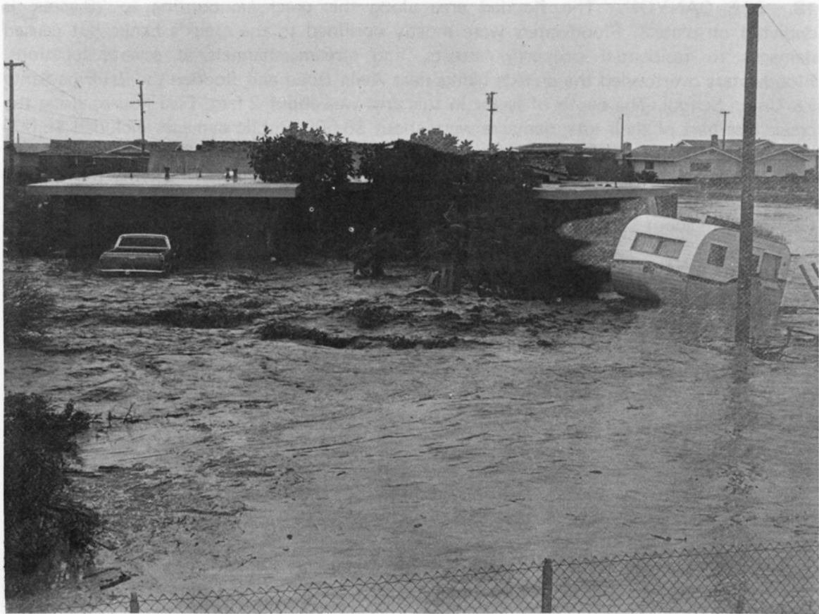
Floodwaters from an unnamed creek in the City of Morro Bay inundated this home west of State Highway 1.