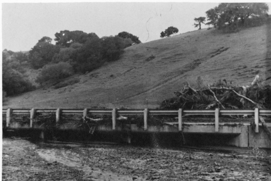
Silt deposit was a major problem along Prefumo Creek, as is evident from view of this bridge.