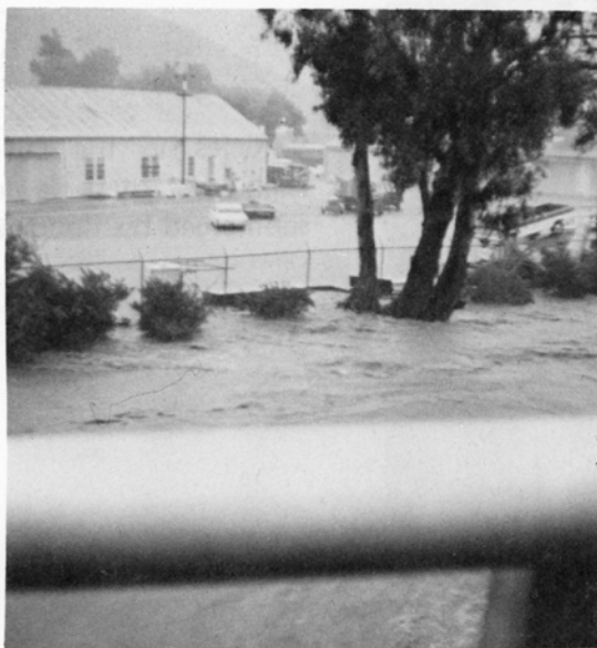
Floodwaters overtop San Luis Obispo Creek downstream from Madonna Road bridge.