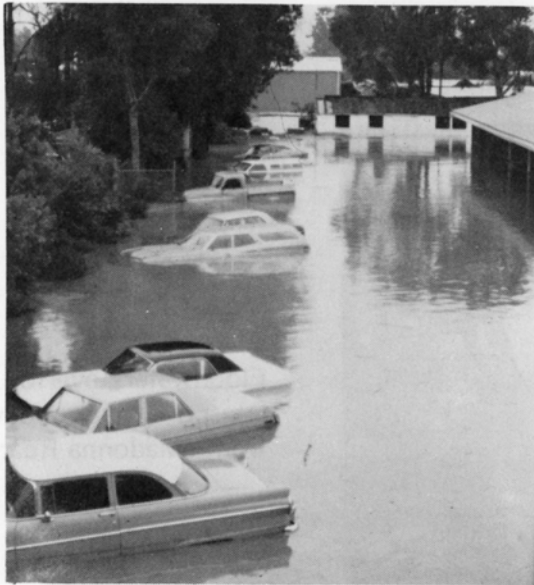
Vehicles in the Division of Highways parking lot are submerged by floodwaters.