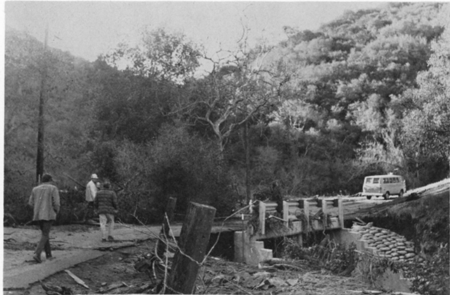
Bridge crossing Prefumo Creek indicates results of damages caused by floodwaters.