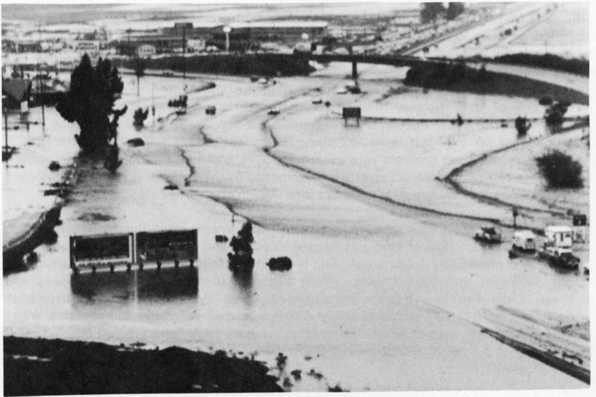
U.S. Highway 101 became impassable to motorists.