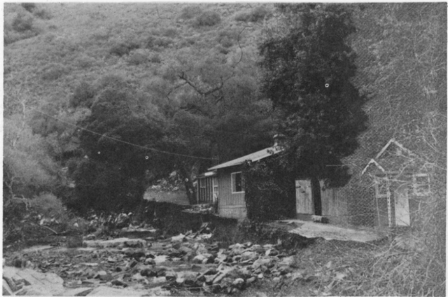
Erosion along Prefumo Creek caused damage to this property.