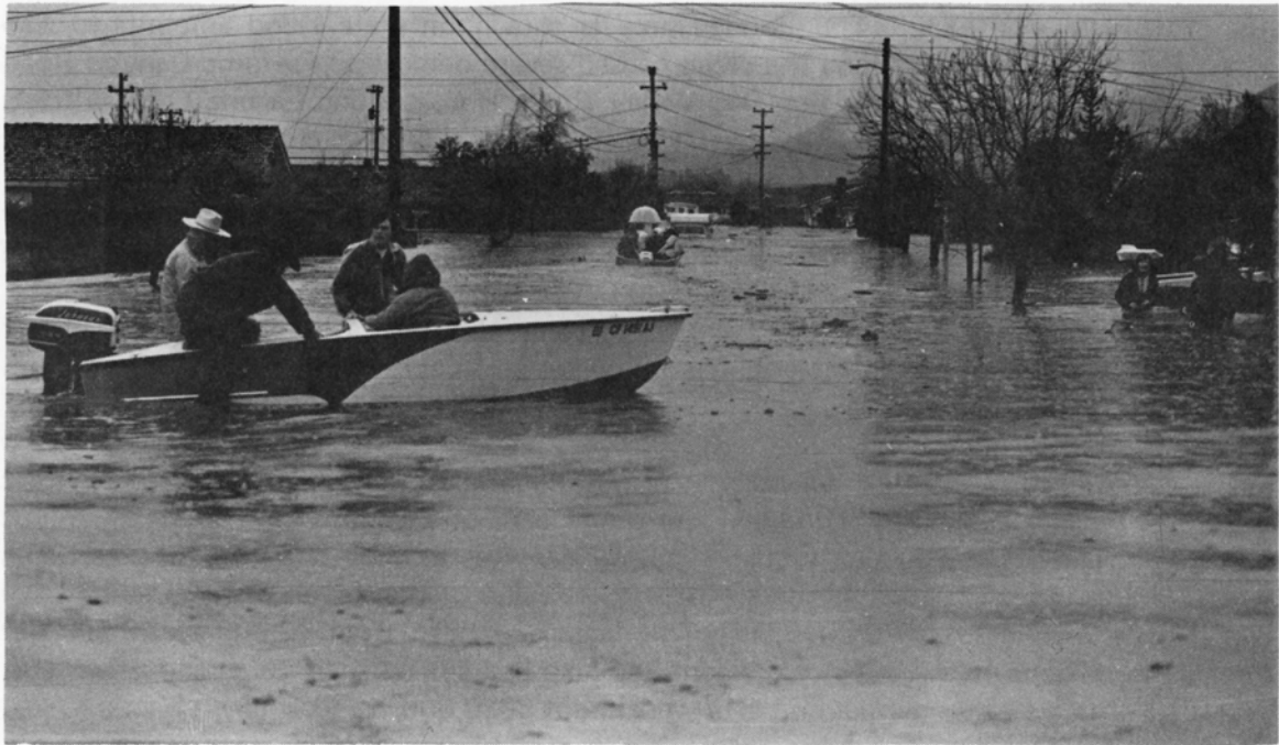
Residents in the Laguna Lake area resort to motorboats as a means of transportation.