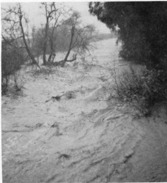
Trees and brush were uprooted by the erosive velocity of floodwaters within the creek.