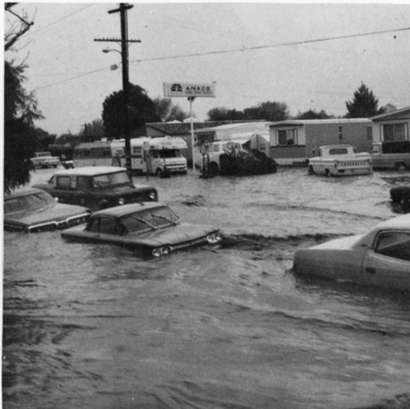
Motorists abandoned vehicles along Higuera Street.