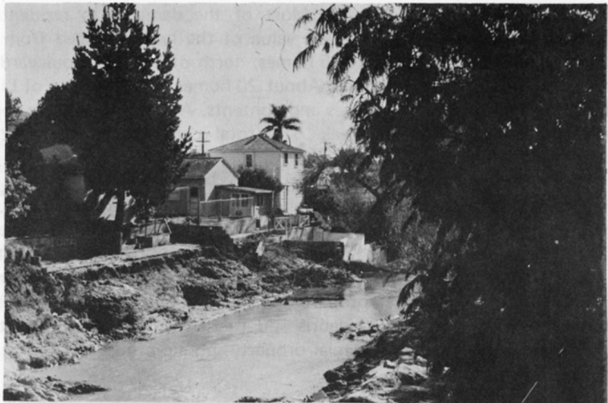
Erosion of land and damaged patios along Stenner Creek.