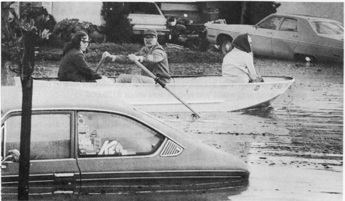
Flood victims take to the rowboat along Oceanaire Drive as floodwaters 3 feet deep inundated the Laguna Lake area.