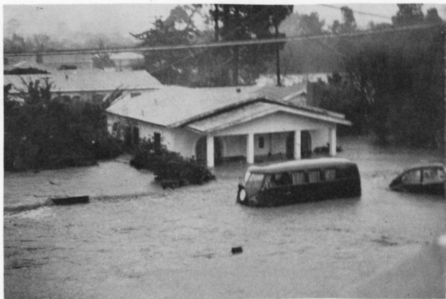
Floodwaters inundated this house on Broad Street and Lincoln Avenue.