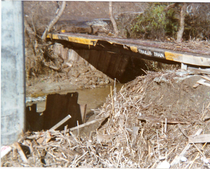
13. Promontory Bridge Prior to 12-22-82 already overtopped by November Storm