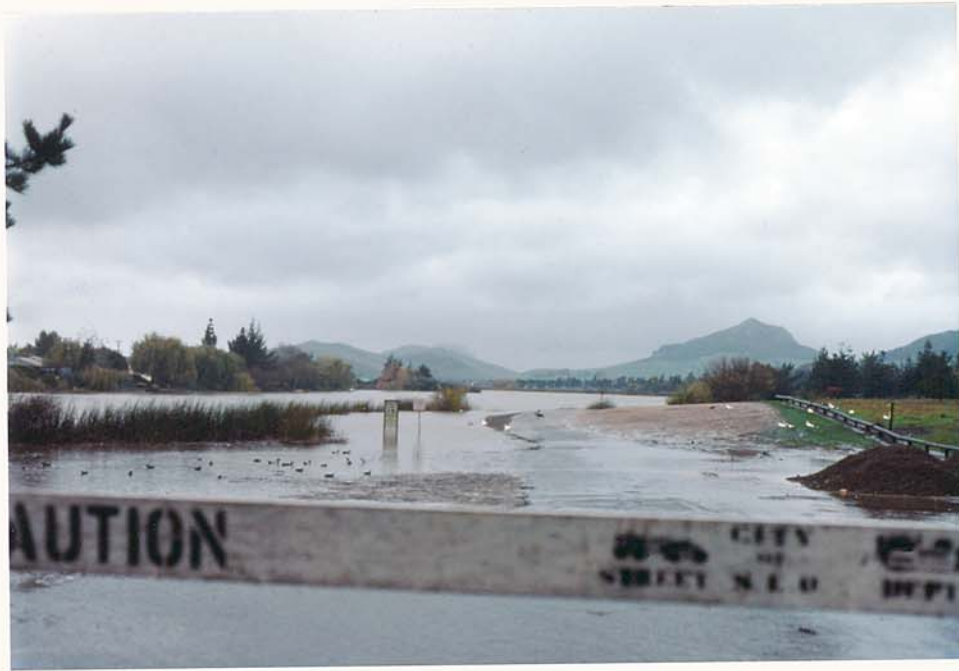
16. Madonna Road at Laguna lake Park