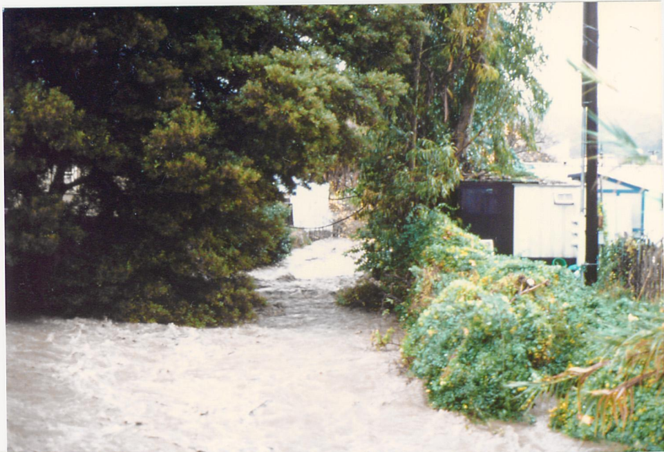
12. (cont'd) Damage at 507 Dana Street Dec. 22, 1982