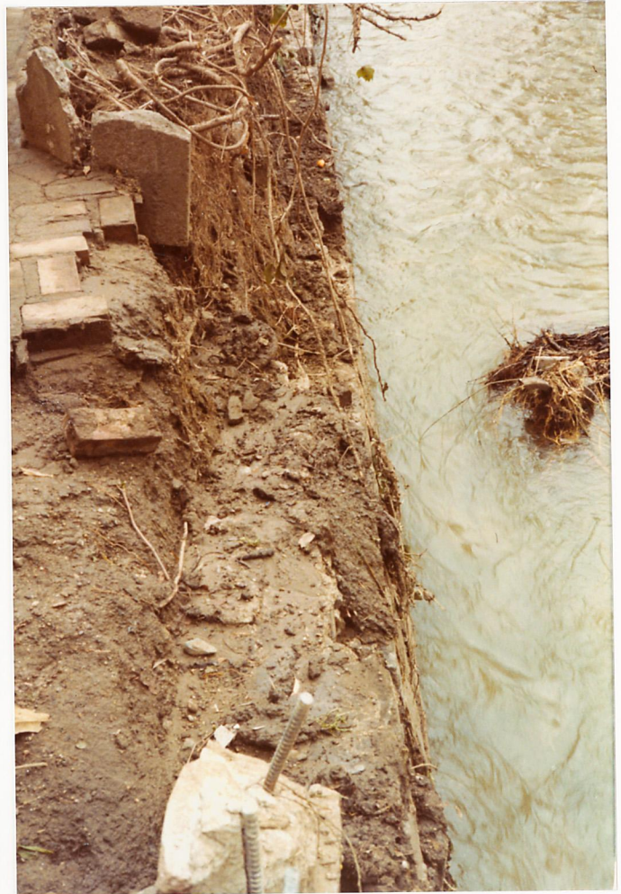
12. SLO Creek at 507 Dana Street Dec. 22, 1982