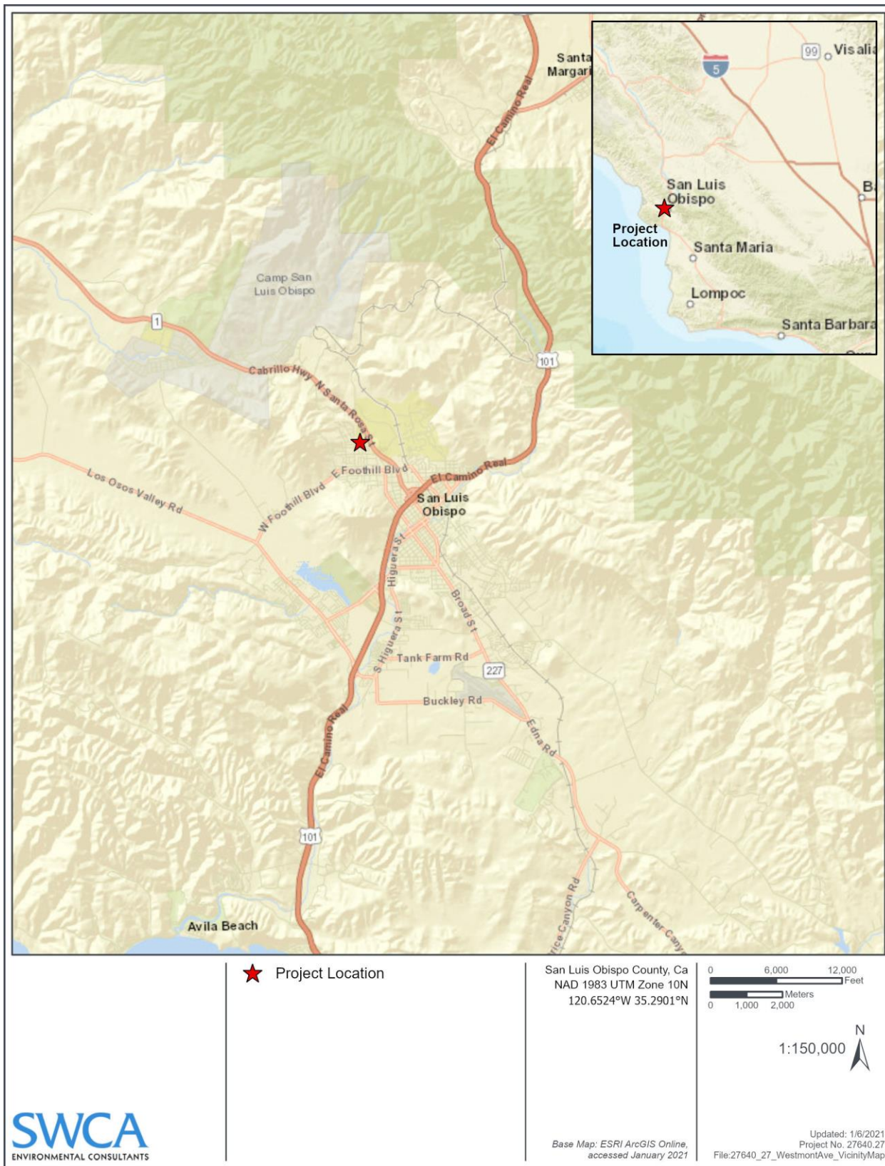
Figure 1. Project Vicinity Map